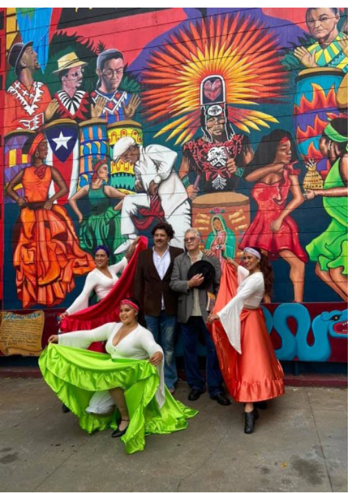
Caption: The Mission's legacy of art, culture, and activism includes murals, a lowrider, and street theater.