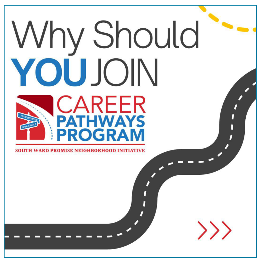
Caption: South Ward Promise Neighborhood's Facebook page is one way to guide residents onto a pathway to a more promising future.

The goal of South Ward Promise Neighborhood's college and career efforts is to put young adults on the pathway to economic liberation by providing access to long-term careers and stable jobs. In turn, many of these individuals will make their homes in the South Ward, creating a virtuous cycle of economic revitalization that will have long-term community impact.