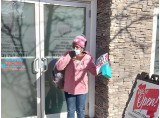
Caption: The South Ward Wellness Center is open—come in!