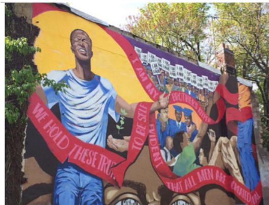
Caption: Murals adorn BRICK's new school location and community garden site.