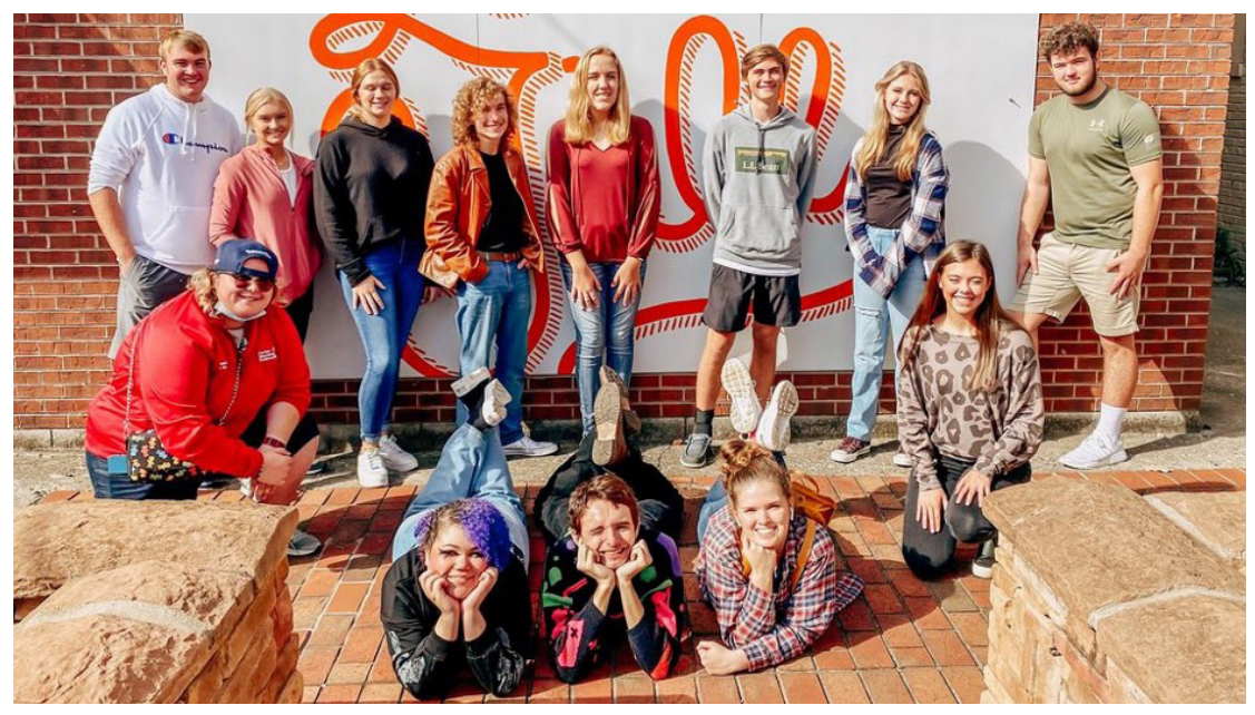
Caption: Student leaders help connect and inform their peers about college opportunities, changes to the Free Application for Federal Student Aid, dual credit in high school, and new career opportunities via the Work Ready Scholarship.

The success of this first Promise Neighborhood encouraged PRI to expand these efforts to more counties through additional Promise Neighborhoods grant funding. Knox County Promise Neighborhood was awarded an implementation grant in FY 16 and Perry County Promise Neighborhood in FY 17. Both counties experienced high poverty and disinvestment. The mining industry formerly dominated the job market in Perry County, but the decline of coal and the subsequent loss of thousands of jobs led to families moving away from the region, and the population fell considerably. The area's remaining residents have faced the challenges of opioid use, persistent poverty, and a lack of investment in the region to create new job opportunities.