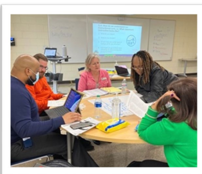
Grand Rapids Southeast Promise Neighborhood uses an appreciative, strengths-based, growth-focused approach to learning.