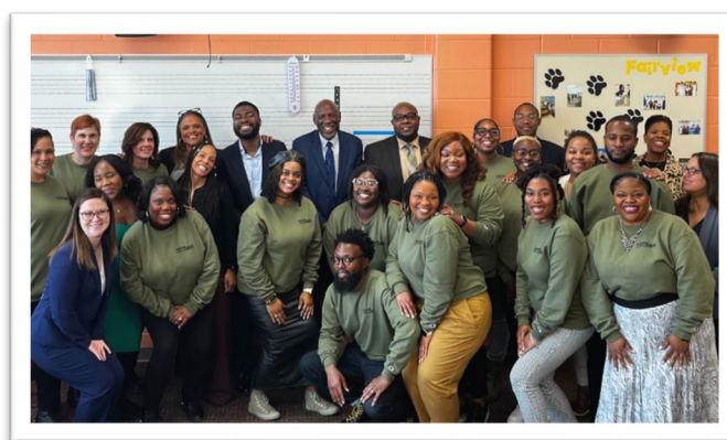
Omega CDC staff with Geoffrey Canada

Hope Zone Promise Neighborhood (FY 2022 grantee). The William Julius Wilson Institute attended the Omega Community Development Corps (Omega CDC) Hope Rising! Gala. Omega CDC is the backbone organization for the new grantee Hope Zone Promise Neighborhood. Harlem Children's Zone founder and president Geoffrey Canada gave the keynote address. See the Tweet about the gala.