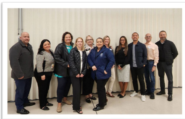
Broward UP and South Bay community services staff