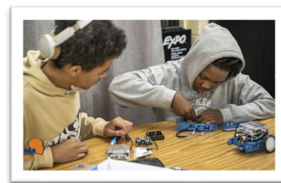
Lancaster Promise Neighborhood's Extended Day Program provides engaging activities outside school hours.