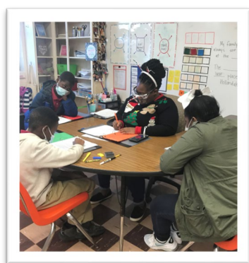
Literacy Fellows started in Indianola Promise Community and expanded to Delta Health Alliance's two additional neighborhoods to serve third-graders across the Mississippi Delta.

This quarter's newsletter features virtual course announcements ; K–12 solutions from Promise grantees in Mississippi, Michigan, and South Carolina; updates on TTA activities ; and other helpful resources .