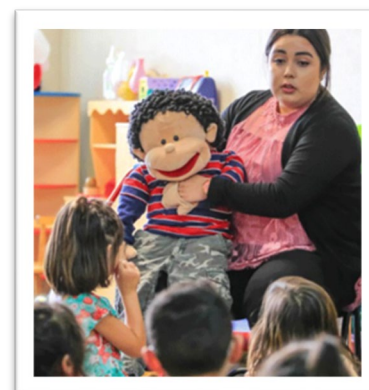
Chula Vista Promise Neighborhood's one-of-a-kind Mi Escuelita Therapeutic Preschool