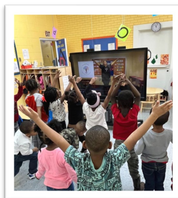
Leflore Promise Community's early childhood program, Promise School